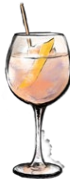
Fig Old Fashioned

Amaro Santoni, Elderflower, Chrysanthemum, Apple, Mint, Lemon, Prosecco