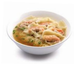
虾仁馄饨汤面 Prawn & Pork Wonton Noodle Soup* 野菜と豚肉入りワンタン麺 478kcal