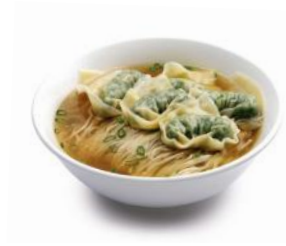
鸡肉蔬菜馄饨汤面 Chicken & Vegetable Wonton Noodle Soup* 鶏肉と野菜入りワンタン麺 403kcal