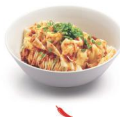
虾仁馄饨川味燃面 Prawn & Pork Wontons with Noodles in Sichuan Sauce 海老と豚のワンタン麺四川ソース味 482kcal