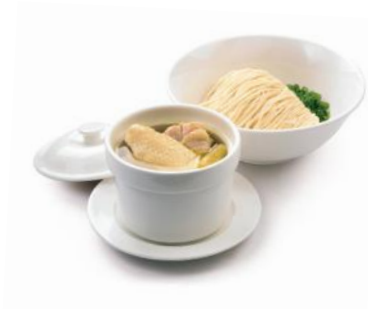
元盅鸡汤面 Steamed Chicken Soup with Noodles 蒸し鶏スープ麺 502kcal